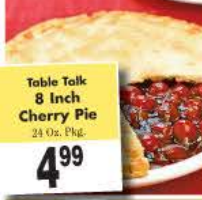
Table Talk 8 Inch Cherry Pie 24 Oz. Pkg. 4 99